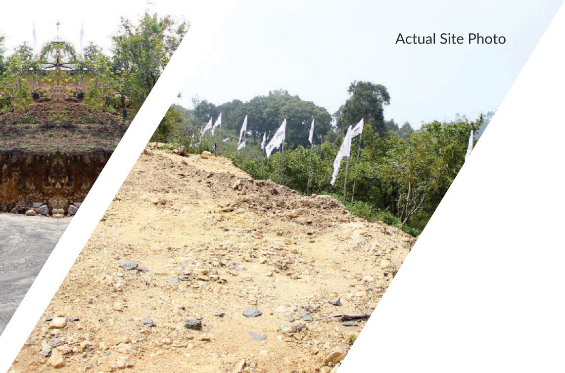
Actual Site Photo

Welcome to your own piece of heaven, set among the misty slopes and lush greenery of the Princess of Hill Stations – Kodaikanal. The exclusive 3 acre layout of Casagrand The Hilltop is located in Pallangi Village just 20 mins from Kodai Lake. Each plot comes with the option of constructing a holiday villa in this fenced and secured community with black top roads and avenue plantations. Your very own paradise, waiting for you.