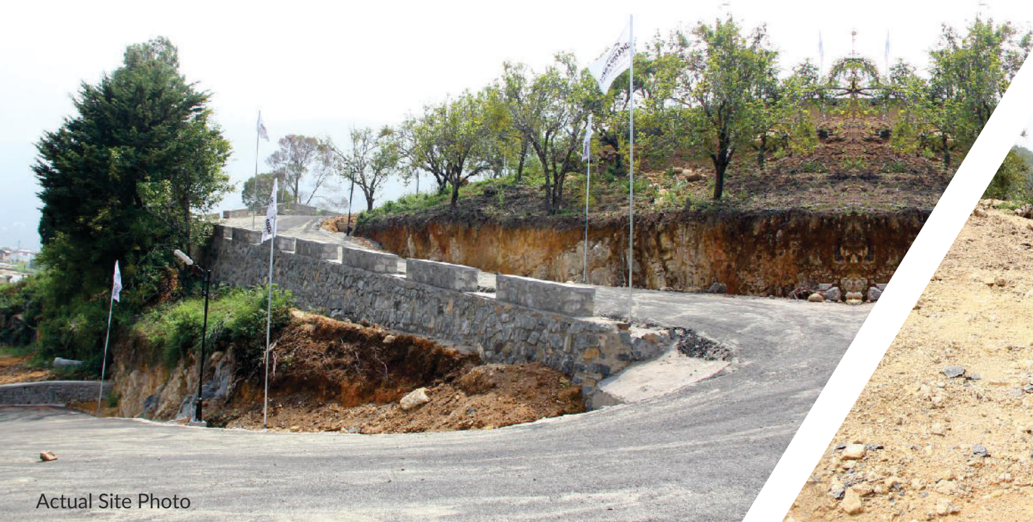
Actual Site Photo